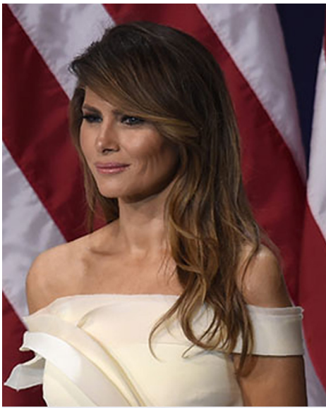
Melania Trump 2017