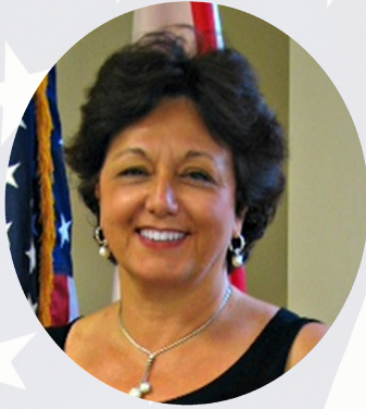
Kathleen Passidomo State Senator