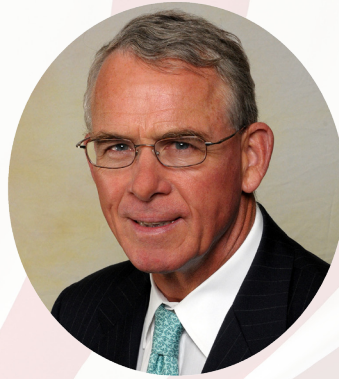
Francis Rooney U.S. Congressman District 19